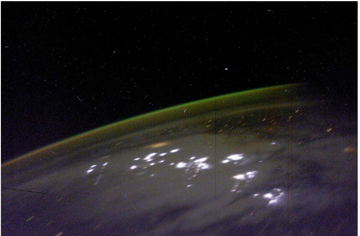
The Geostationary Lightning Mapper (GLM) on the next generation of GOES satellites will detect the very rapid and transient bursts of light produced by lightning at near-infrared wavelengths. This image was taken from the International Space Station and shows the Aurora Australis and lightning.

on the Earth's surface while the planet rotates around its axis — a “geostationary” orbit. NASA and NOAA scientists are working on an advanced lightning sensor called the Geostationary Lightning Mapper (GLM) that will fly onboard the next generation geostationary operational environmental satellite, called GOES-R, slated to launch around 2015.