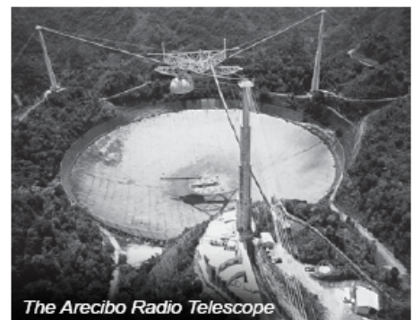
The Arecibo Radio Telescope