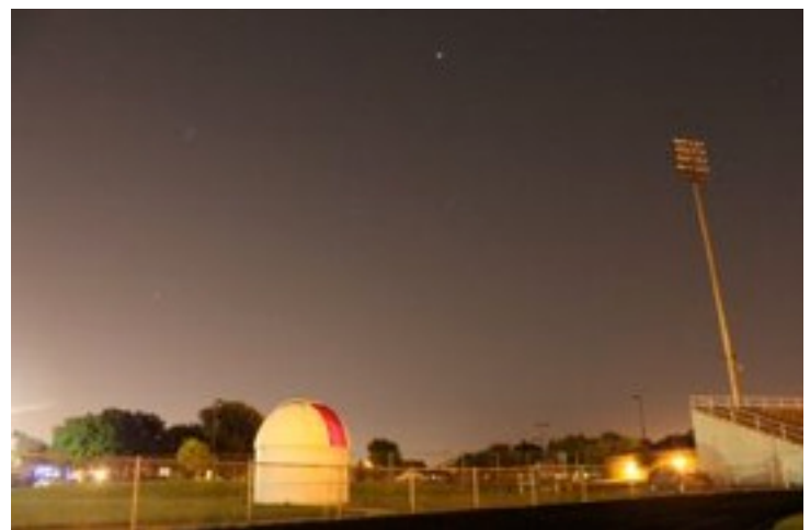
After midnight, 20 parking lot lights are turned off. The old bleachers are being demolished and will be replaced. Small dot in the top of the photo is Jupiter.

I took my 10 inch Newtonian out of the observatory and stored it in Dexter, at a friends house. I left it in Dexter setup and ready to roll out for observing under the darker skies out there.