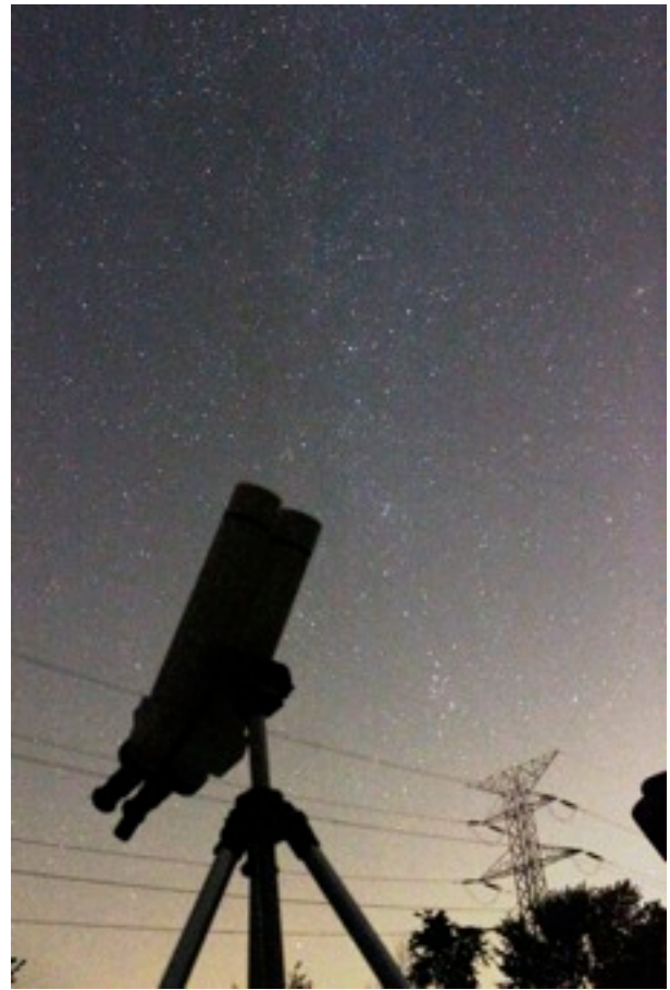
A bunch of kids, answer questions about “the planets” and then line up in position to show everyone how the solar system is arranged.

Art Parent (above) Looks through his Meade SCT at Island Lake, August 19, 2011 astronomy star party. Faint clouds and haze prevented perfect skies.