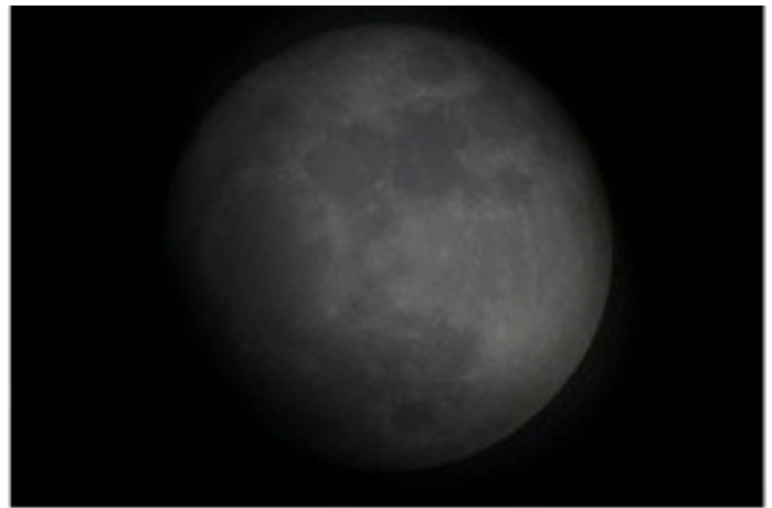
Above: AFocal handheld photo of Super Moon event, through 32mm Nexstar 4SE. Shadows are due to lack of ideal lens positioning of the camera.