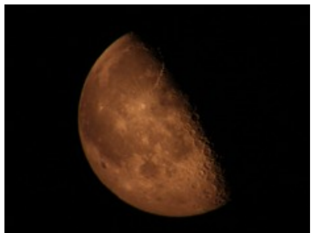
Morning moon - Early morning Canon t1i handheld photo through one side of a BT-80 binocular refractor

Later that evening, once everyone else had gone to bed, I watched a bright spec of light emerge from the edge of Jupiter, joining the three others, and a smile broke across my face in the dark.