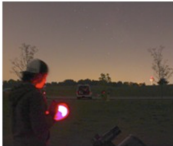
Above: Sean Swisz checks out a star chart with his 10 inch dob just out of the photo. Island Lake Multi-Club Picnic.

Without brightening, you wouldn't see Doug in the above photo, the skies were very dark. Clouds threatened in the north for a short time during the night's observing, but soon moved on.