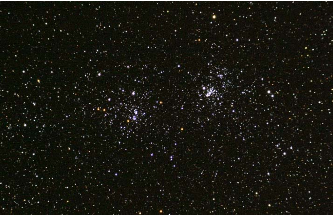
Jim Frisbie Double Cluster

Taken at the Dark Sky Workshop, Gladwin Michigan 11:17 pm, September 7, 2007. Canon 10D William Optics Megrez 90, f/6.9 Vixen Great Polaris Mount ST5C Auto Guider 4 x 3 minute exposures stacked.