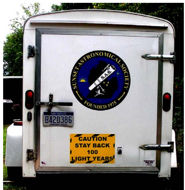
100 ly is a long way – as discussed above – even as this caution warned drivers, at the 2007 Great Lakes Star Gaze.