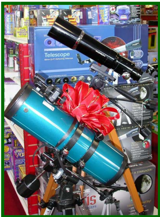
Foreground: Beginner's outfit from Orion costs just $199 - the Starblast EQ! Behind: New "Orion Express" for $399, here displayed at Rider's.

Also, John says, check out the new binoviewer from Orion, for only $199! Some great gifts ideas .... (NOTE: prices are approximate, and may vary, depending on packages, and specials).