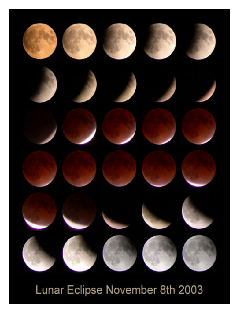
This composite is the result of Tony's efforts during the eclipse.