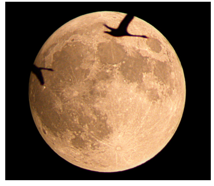
Tony took this picture from Lake Erie Metropark, Nov. 8th 2003. at 6:10 pm, while the moon was in the penumbra of earth's shadow using a Nikon CP 995 and SW102 f/5 afocally thru 40mm EP.