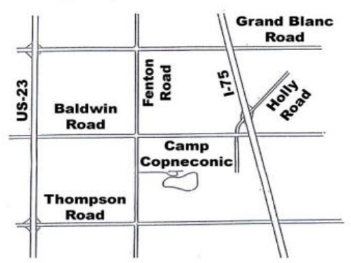
US-23 from the South: Follow US-23 to Thompson Rd. exit. Exit, turn right and follow until you come to the second flashing light. This is Fenton Rd. Turn left and follow for 1/2 mile to the camp entrance (on the right side).

I-75 from the South: Exit at Holly Rd (exit 108), turn left and drive to flashing light (Baldwin Rd.) Turn right on Baldwin Rd. and follow to the next light (about three miles). This is Fenton Rd. Turn left and follow until the camp entrance (on the left side).