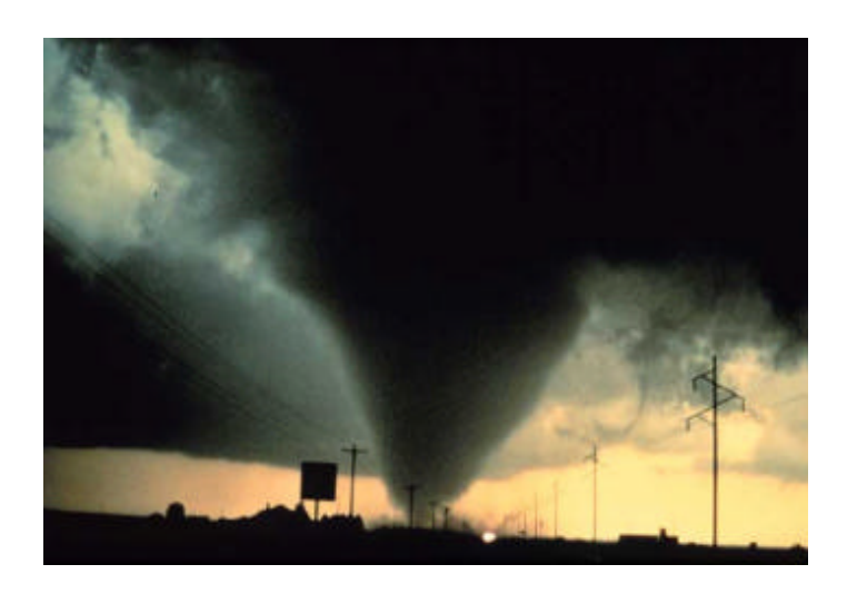
This severe tornado hit south of Dimmitt, Texas, on June 2, 1995

This article was provided by the Jet Propulsion Laboratory, California Institute of Technology, under a contract with the National Aeronautics and Space Administration.