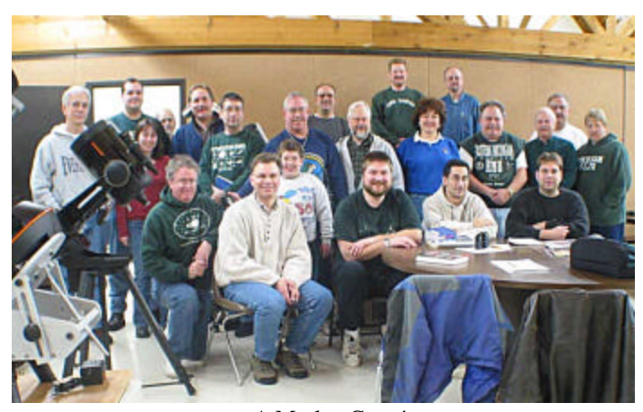
A Motley Crew!

The 1st annual CCD / Astrophotography Workshop was held on January 31 – February 2, 2003 at Fish Lake (K.E.E.C., EMU's remote biology reserve near Lapeer, MI). KEEC is located east of Flint where skies allow viewing of faint astronomical objects that cannot be seen from the Metropolitan Detroit area. Late last year, during a phone conversation, Norbert Vance and I came up with an idea to host a workshop on CCD imaging and astrophotography. January is often very cold and frequently cloudy, but our intent was to bring together people with like interests and converse and share ideas with respect to imaging, and if lucky, get some hands on experience using various types of equipment. Well, as one would expect during this time of year, it was cloudy but a fresh snowfall, made for some beautiful winter scenery. After an introduction by Norbert Vance, valuable and interesting information was presented throughout Friday night and Saturday by experienced local amateurs in the science and art of astrophotography. I would like to thank Clayton Kessler, Jim Frisbie, Norbert Vance, Carl Burton, and Bruce Johnston for their informative talks! It took a great deal of effort on their part to prepare these talks and share ideas and experiences. Their efforts were greatly appreciated. Saturday's enthusiasm became solemn