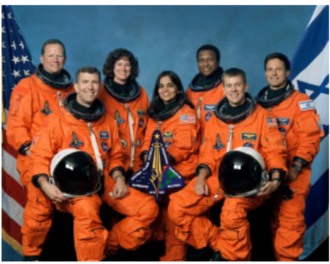
Crew: Shuttle Columbia